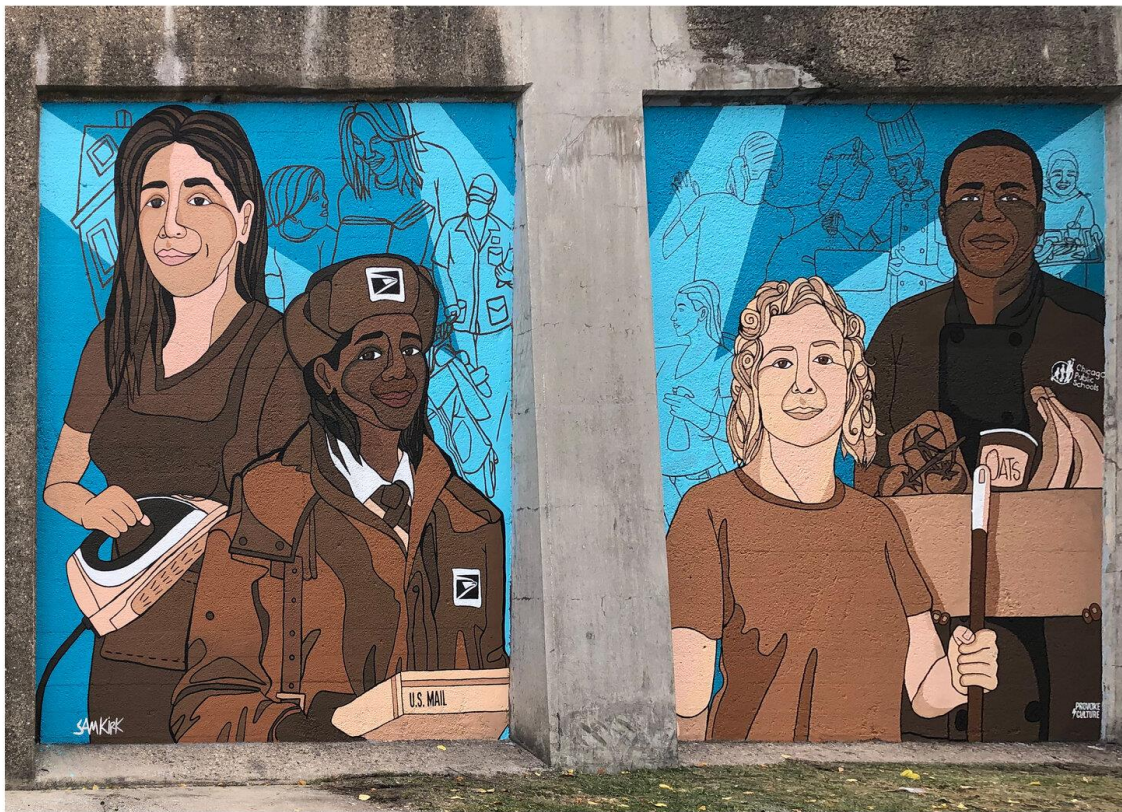
Artwork by sam.kirk . Tribute to Essential Workers Mural, Chicago, 2020